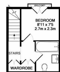
2ND FLOOR APPROX. FLOOR AREA 171 SQ.FT. (15.9 SQ.M.)

CORNWALL ROAD TOTAL APPROX. FLOOR AREA 803 SQ.FT. (74.6 SQ.M.)